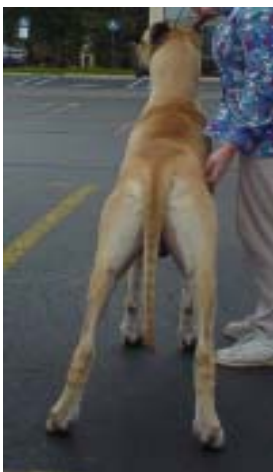
Fawn dog (left)

A wide croup allows for strong thigh musculature from the rear as well.