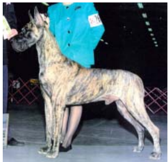
Brindle dog (right): Well angulated front and rear The hocks are relatively short.

The upper thigh is the same length as the second thigh. The second thigh has good width.