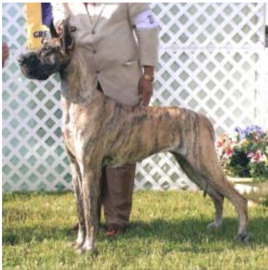
Brindle bitch (left):

The rear should be well-angulated, matching the front. The hocks are relatively short (“well let down”).