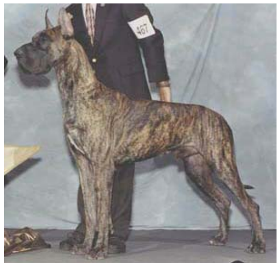
Males also have elegance as well as size and substance. Note the length in head, neck, and legs.