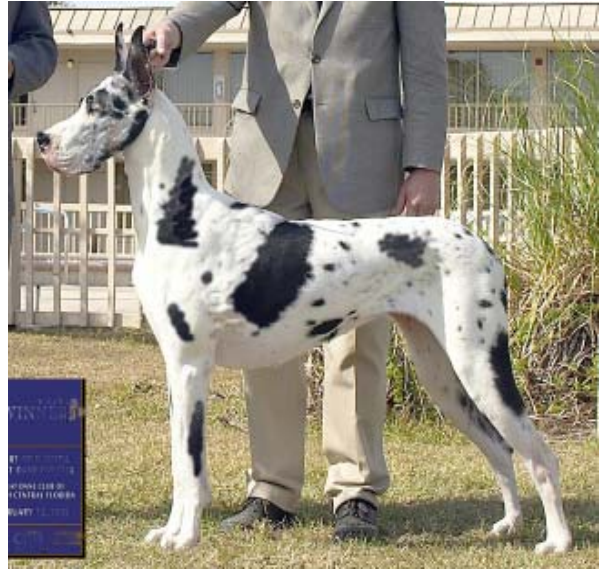
These bitches above illustrate the balance of size and elegance and substance; they have unity.