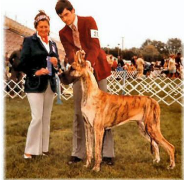
CH Rojon's Please Me

I have made some wonderful friends who share the same regard for Great Danes. Also having been given the opportunity to judge the GDCA National. My greatest success to date in breeding dogs has been to see the progression of traits I feel are important to the breed, in other words taking a negative and turning it into a positive.