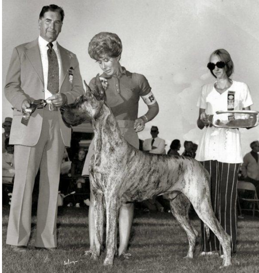
BISS CH Rojon's The Hustler

Though never will I breed the absolute perfect Great Dane I will continue to strive to that end.